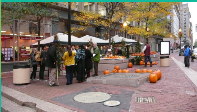
Artists and Chinatown Community Residents plan for for R Visions!

CPA was founded in 1977 out of a series of community organizing campaigns around issues such as Chinese parents' input into the Boston school desegregation process and organizing for community control over land development in Chinatown. Our membership is made up predominantly of Chinese immigrants and the Chinese-speaking; most are workers in low wage industries, working families, or low-income elderly. CPA has no single issue focus because we believe that people have many concerns—jobs, education, freedom from discrimination, a clean and safe living environment. We have seen that once people achieve their rights in one aspect of their lives, they will be more likely to actively participate in solving other community problems.